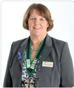
HEATHER LOVEDAY IPS President

The Infection Prevention Society (IPS) is a charity and professional organisation for all those committed to enhancing patient safety and preventing harm from healthcare infection and communicable disease. During 2014 the global infection prevention community has been focused on the infection threats posed by antimicrobial resistance and epidemics of Ebola in West Africa and Middle East Respiratory Syndrome coronavirus in the Arabian Peninsula. While each of these pose particular challenges that are exacerbated by international travel, they also highlight that the fundamental principles of infection prevention and control are our first and most effective line of defence against emerging and known infection threats.